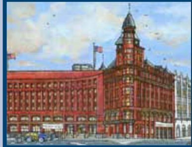
FEB. Breaking News at the Review Building Iconic Crescent-Shaped Building near Spokane Falls DOWNTOWN SPOKANE