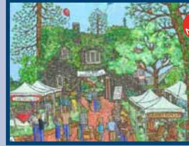
AUG. Gathering at the Arbor Crest Gatehouse Basaltic Rock Gatehouse to the Historic Cliff House THE SPOKANE VALLEY