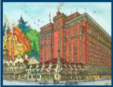
NOV. Dallying at The Davenport Historic Beautifully Restored K.K. Cutter Designed Hotel DOWNTOWN SPOKANE