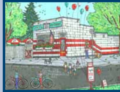
JULY Doyle's Darling Ice Cream Parlor Old Ice Cream Parlor on the Trolley Route to Nat Park THE NORTH SIDE