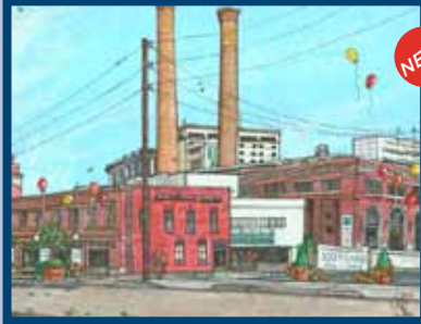
JUNE Historic Steam Plant Restored Steam Plant Building with Twin Brick Towers DOWNTOWN SPOKANE