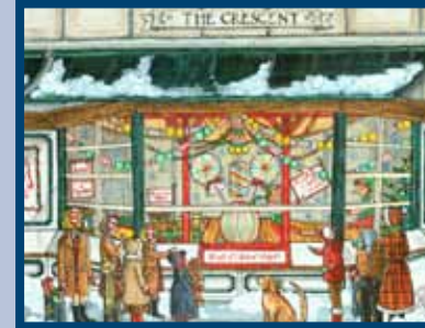
DEC. The Crescent Window at Christmastime Historic Crescent Department Store Animated Window DOWNTOWN SPOKANE