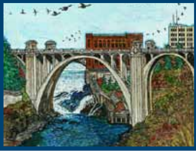
JAN. Flying South Over Spokane Falls Monroe Street Bridge Overlooking Huntington Park DOWNTOWN SPOKANE