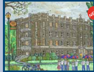
APRIL. Daffodils in the Rain at DeSmet Hall Oldest Dormitory on Gonzaga U Campus NORTH SIDE