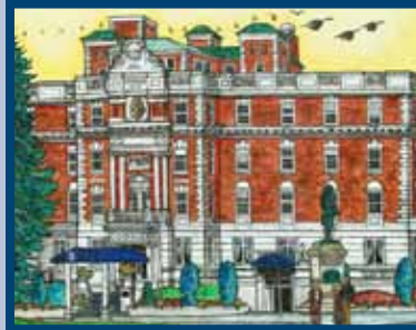
MAR. Sunday Brunch at the Spokane Club Elegant City Club with Folks Meeting for Breakfast DOWNTOWN SPOKANE