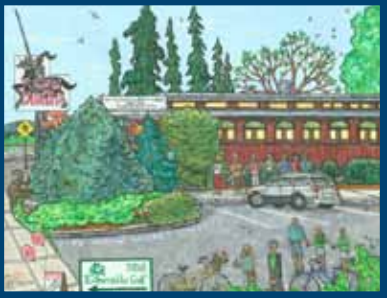
MAY Breakfast Bunch at Knight's Diner Historic Restored Pullman Car on Market Street THE NORTH SIDE