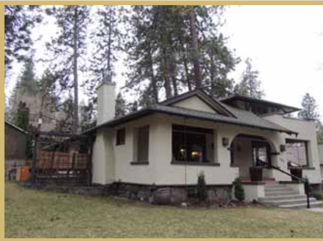
(Above) Two homes nominated to the Spokane Historic Register - the top one on Sumner Avenue and the lower one on West Shoshone.