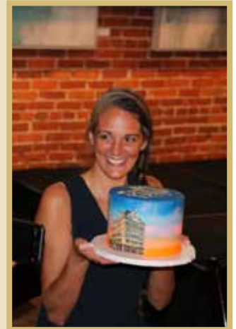
(Above) Smiling guests enjoying a fabulous time at the recent "Sparkle & Spend" Fundraiser at Barrister Winery.