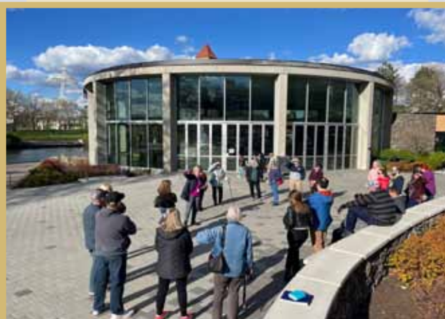
(Below) Group of interested folks at Spokane's Riverfront Park gathering for a recent HPO walking tour.

A BUSY FIRST HALF OF THE YEAR ● The Historic Preservation Office had a busy first half of 2022. The Spokane Historic Landmarks Commission (SHLC) held several public hearings on design review projects including: