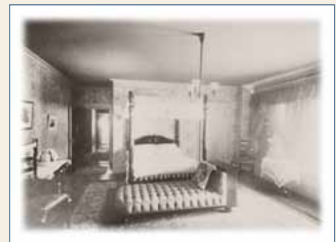
Period photograph of the large guest room where new reproduction wallpaper was recently installed on the second floor of the Campbell House