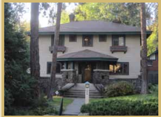
Franklin Manz Homes on 526 East 12th (above) and 352 East 12th (below)