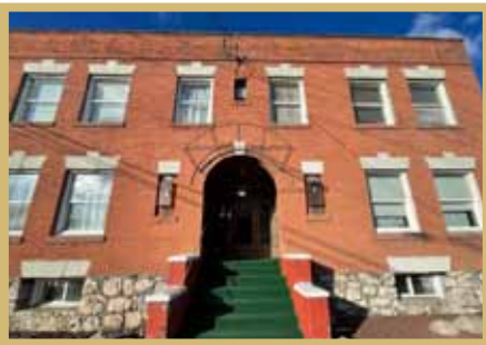
The Walden Apartments • 1428 West Dean