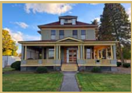
The Judge Black House • 2615 West Maxwell