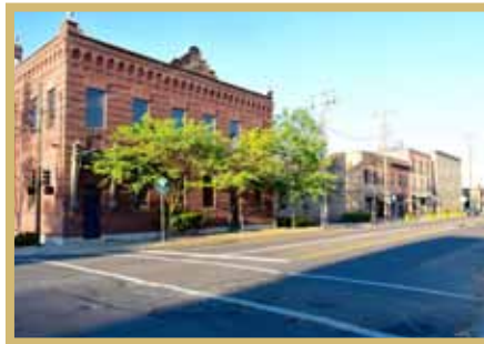
Spokane Brewing and Malting • 901 West Broadway