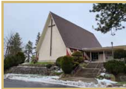
Highland Park Methodist Church • 611 South Garfield