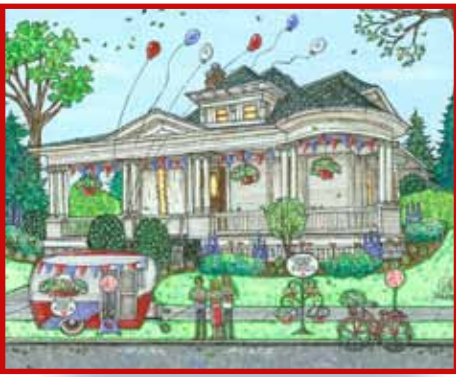
"HOME SWEET HOMES" ON THE NORTH SIDE • ALPHABETICALLY BY NEIGHBORHOOD

31 FINE ART "AMERICANA" PAINTINGS OF PRETTY PUBLIC PLACES • INCLUDING THE GRADE SCHOOL THROUGH GRAD SCHOOL GONZAGA COLLECTION, OTHER SCHOOLS AND CHURCHES • PLUS "HOME SWEET HOMES" INCLUDING COZY COTTAGES, MARVELOUS MANSIONS AND MORE!