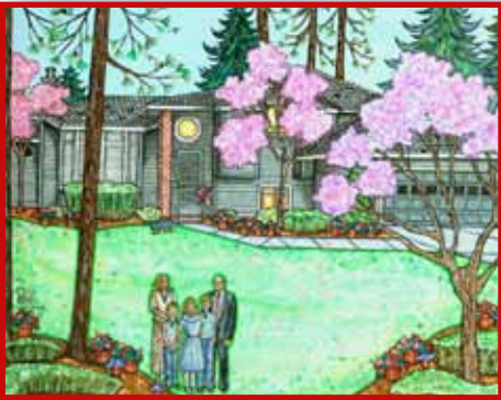
"HOME SWEET HOMES" • INDIAN TRAIL ROAD NEIGHBORHOOD