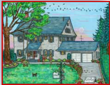
Gathering Geraniums at the Hennessey House (Bleeker House) ~ 8.2003

"HOME SWEET HOMES" • WEST POINT ROAD ON THE CLIFFS ABOVE THE SPOKANE RIVER