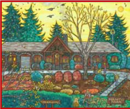
Afternoon at the Manito Administration Building (Headhouse) ~ 9.2019