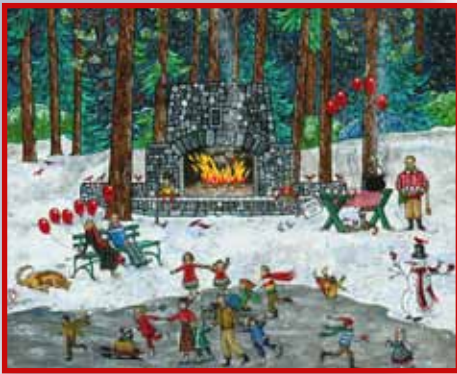
Fun & Frolic at the Manito Fireplace ~ 11.2006

At the west end of the Manito Park's Duck Pond (also known as Mirror Lake), a massive basaltic rock fireplace was built in 1955 as a memorial to Lt. Lawrence Rist, an Air Force officer who was killed in action in the Korean War. For decades growing up in Spokane, my parents took our family ice-skating during the Winter months on Manito Pond. At that time the city and local fire department took pains to keep the surface smoothly groomed for skaters. Highlight - There was nearly always a fire blazing for folks who were chilled and in need of warming up and a hot beverage. I filled this scene with family and friends enjoying the day.