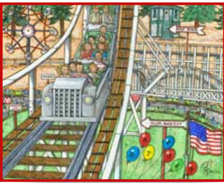
Riding the "Jack Rabbit" at Nat ~ 6.2009

30 FINE ART "AMERICANA" PAINTINGS OF INLAND NORTHWEST PARKS AND GARDENS • INCLUDING MANITO PARK, THE MOORE-TURNER HERITAGE GARDENS, OTHER SPOKANE COUNTY PARKS, AND RIVERSIDE AND MOUNT SPOKANE STATE PARKS