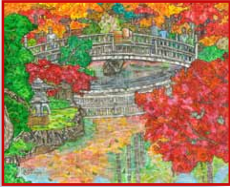
Autumn Splendor at the Japanese Garden ~ 9.2020