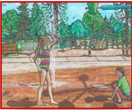
The Splash Pad in Summer ~ 3.2020

30 FINE ART "AMERICANA" PAINTINGS OF INLAND NORTHWEST PARKS AND GARDENS • INCLUDING MANITO PARK, THE MOORE-TURNER HERITAGE GARDENS, OTHER SPOKANE COUNTY PARKS, AND RIVERSIDE AND MOUNT SPOKANE STATE PARKS