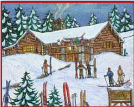
Historic Frances Cook Cabin ~ 2.2014